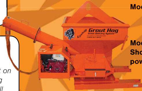
Model UGPHC75 Shown with optional gas power and crane bail

"Our company has three Grout Hog's that we work with. We purchased our first Grout Hog about 10 years ago and still use it on our jobsites. Our most recent purchase was the Uphill Grout Hog and it was definitely a great addition to our fleet. We really can tell the increase in production time when using these products."