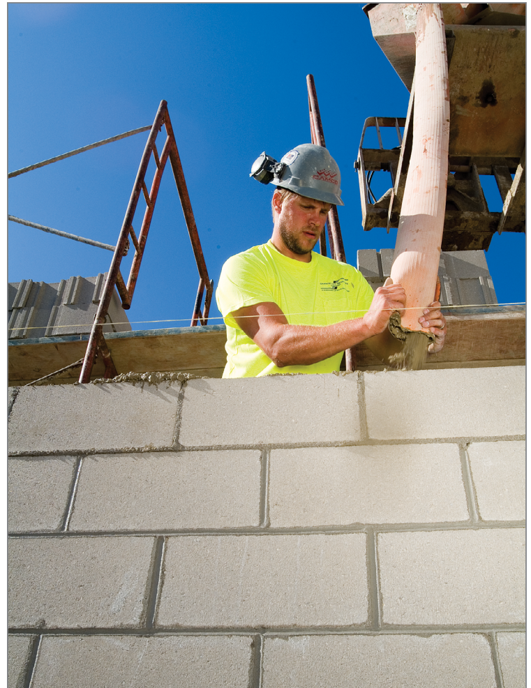
SPEC MIX SCG reduces labor by eliminating consolidation and reconsolidation of masonry grout.

SPEC MIX Core Fill Grout is a dry, preblended mix with high flow. Formulated to fill masonry voids, it meets ASTM C476 requirements for reinforced masonry construction. SPEC MIX Core Fill Grout is a fluid cementitious material that bonds