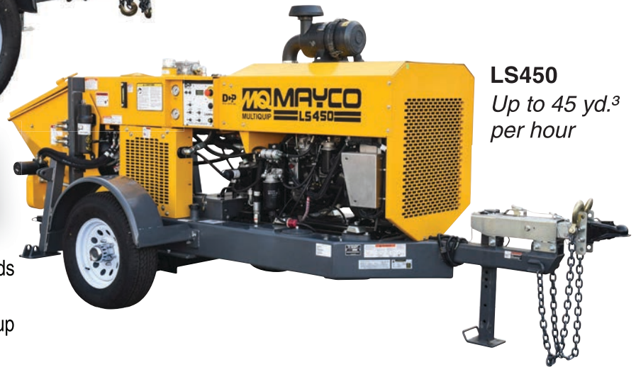
LS450 Up to 45 yd. 3 per hour