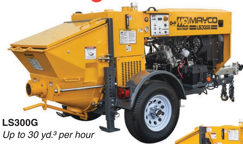
LS300G Up to 30 yd. 3 per hour

The economical way to place up to 1½" aggregate concrete pump mixes.