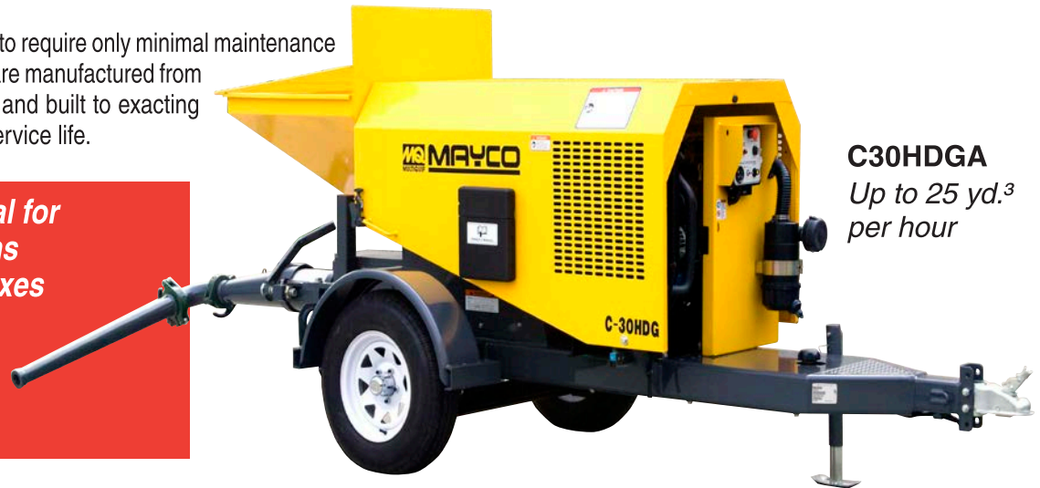
C30HDGA Up to 25 yd. 3 per hour

Mayco replacement parts are reasonably priced and readily available. Additionally, our nationwide network of dealers is ready to provide service and technical support no matter where your job is located.